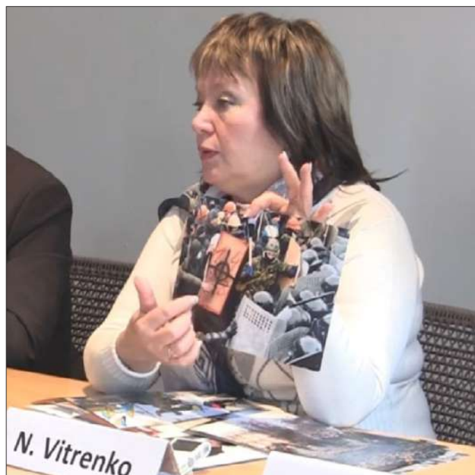
Natalia Vitrenko, former MP and leader of the Progressive Socialist Party of Ukraine, toured Europe days after the February 2014 coup in Kiev. She warned officials in France, Italy, Germany and at the European Parliament, that the new leadership was rife with fascists. Here, at a 1 March 2014 press conference in Frankfurt, she shows photos of "Maidan" placards with white supremacist and Nazi symbols and slogans.

like in France". A disproportionately high number of the demonstrators hailed from far western Ukraine, and pre-planned violence by the Banderite paramilitary group Right Sector was used for systematic escalation of the Maidan.