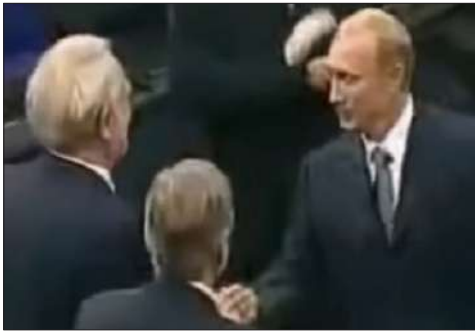
President Vladimir Putin greets Members of Parliament in Germany, after his speech of 25 September 2001 that hailed the end of the Cold War.

later, on 10 February 2007 at the annual Munich Security Conference, shocked the audience. The Western media and some people who were present, including the war-monger American Sen. John Mc-