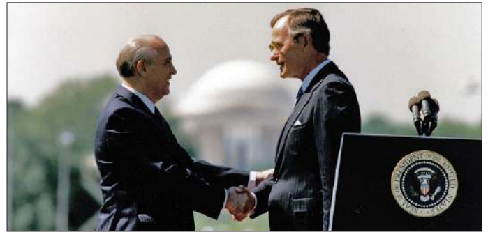
President George H.W. Bush (r.) shakes hands with Soviet leader Mikhail Gorbachov in Washington, May 1990.

Promises were made to the Soviet Union—and thus to Russia as its recognised legal successor as a nuclear-weapons power—at the outset of this period, all of which have been broken over the past thirty years. Already in February 1990, then-Secretary of State James Baker promised Soviet leader Mikhail Gorbachov and Foreign Minister Eduard Shevardnadze that after German reunification, which came about later that year, even if US troops remained in Germany “NATO’s jurisdiction would not shift one inch eastward from its present position”. This was confirmed in official US files released in 2017. 2