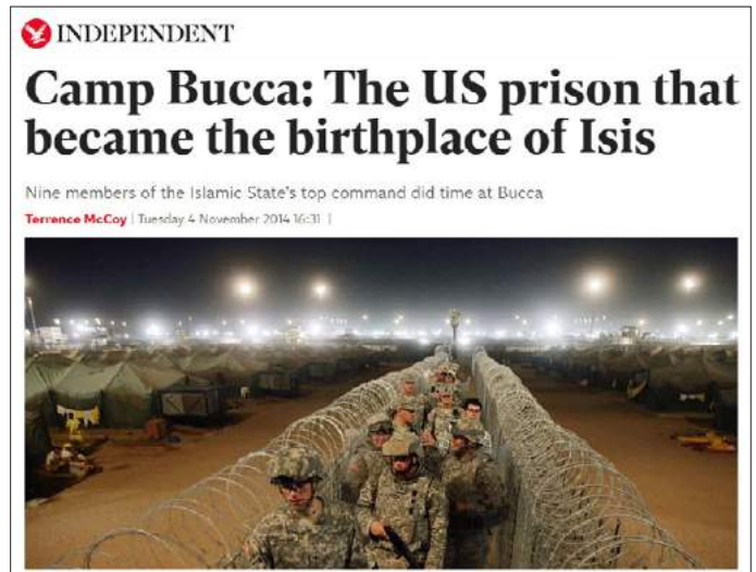
US de-radicalisation camps were "virtual terrorist universities"