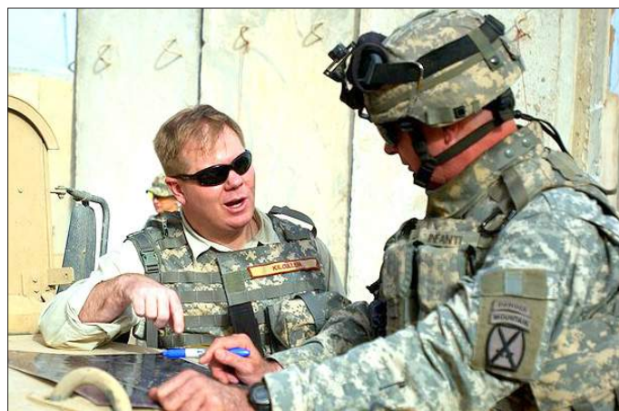
Australian counterinsurgency expert David Kilcullen (left) in Iraq in 2007, in his role as adviser to Gen. David Petraeus, commander of coalition forces in Iraq.

The teams of which Kilcullen has been a part are a military-strategic arm of the Anglo-American financial Empire, centred in the City of London and Wall Street, whose leaders imagine their power to be permanent. When their system is shaky, as it has been off and on since at least the Wall Street crash of 1987, then the military’s job in the international arena is to crush potential leaders of an alternative system, one that would put the interests of nations and their populations above those of the financiers. This motive underlies the dedication of leading circles in the Anglo-American establishment, ever since what should have been the end of the Cold War in 1989-91, to the 1992 “Wolfowitz Doctrine”. Formulated by then-Under Secretary of Defence for Policy