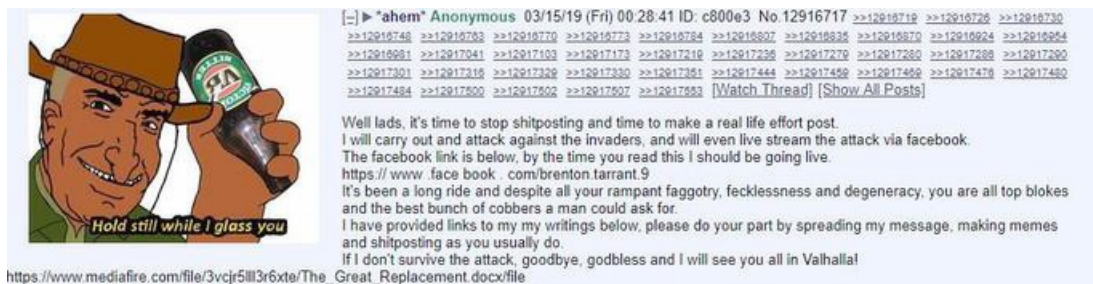
The 8chan bulletin board comment Tarrant posted announcing his attack.

Citizens Electoral Council has documented, the common thread running through every domestic terror attack in both Australia and the UK in recent decades is that the perpetrators have all been well known to the security and intelligence services, and in many cases their actual agents. Whilst most of these have been Islamist extremists, Britain’s MI5 in particular is known for its control and deployment of right-wing groups, such as the “loyalist” terrorists it used to stoke the 30-year (1968-98) undeclared Irish civil war known as “the Troubles”. The Australian Security Intelligence Organisation (ASIO) also has long-established ties with both Islamist and far-right organisations, which can be played off against each other whenever the establishment wants to polarise the community for political purposes.