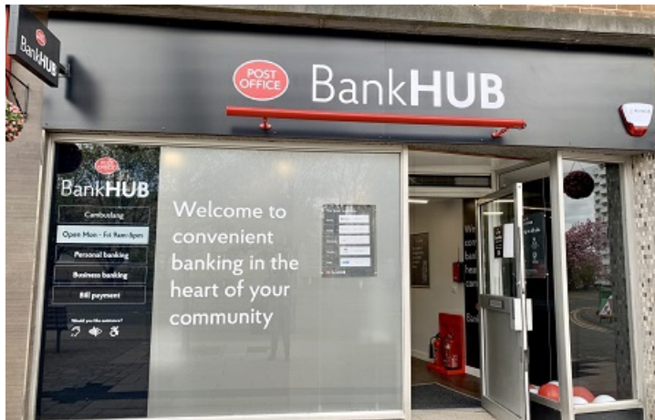
One of the new “BankHUB” outlets which combines various banks.